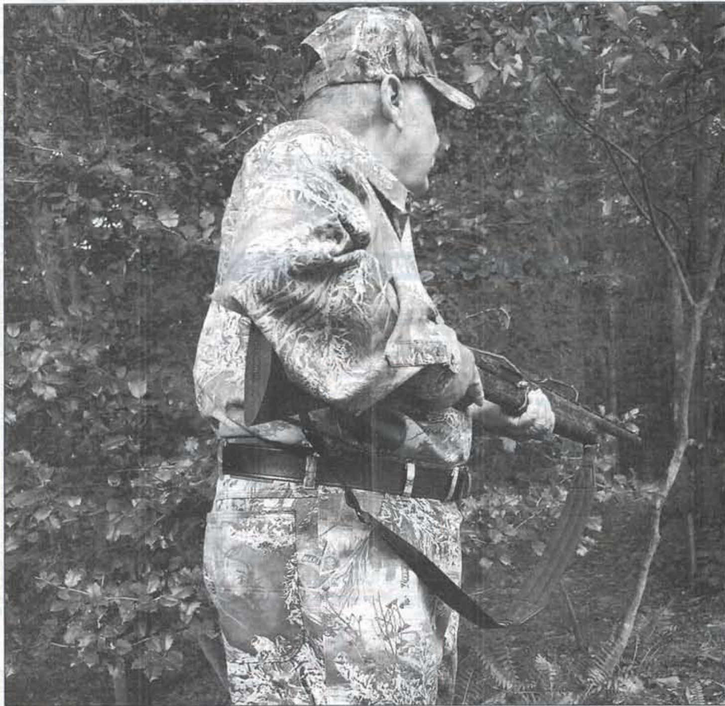
Advantage MAX-1 camouflage clothing from the Wrangler Company is wonderfully effective in hiding hunters from the sharp eyes of wild game.

Knife sharpener is a winner — I readily confess that I'm a knife fanatic. I own knives that I bought while visiting Argentina, Brazil, Germany, Austria, Canada and, of course, in this country. In decades of hunting and fishing, I've spent hundreds of hours working with whetstones, electric grinders, hand-cranked sharpening wheels, steels — you name it. But how often have we been told that a new knife "sharpening system," as the professionals say, will end all our worries concerning sharp edges? Some of them do the job, but too many require a considerable investment of time and the taking of too many sharpening steps. Forget all that now. The hand-sized Australian