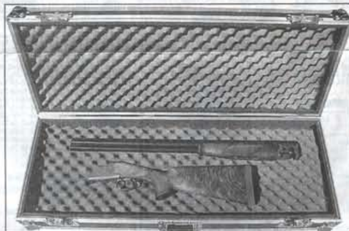
This Wing and Clay Model is perfect for the trap and sporting clays shooter as well as hunters. The suggested retail cost is $185.